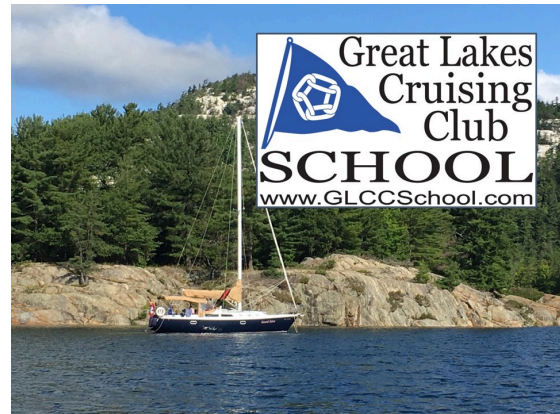
Let GLCCSchool webinars save you LOTS of trouble

I'M READY TO START CRUISING: The long-awaited start of our cruising season across the Great Lakes is here. Harbors are filling, lines are being cast off, and once again our community is returning to the water we all cherish. There is something special about these early summer weeks — long daylight hours, fresh